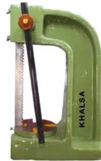
Arbor Press - Square Ram