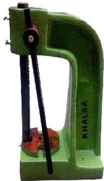
Arbor Press - Round Ram